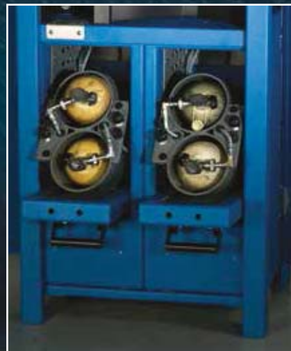
Unique AirLock access door, "click door handle down to open, click door handle up to close"